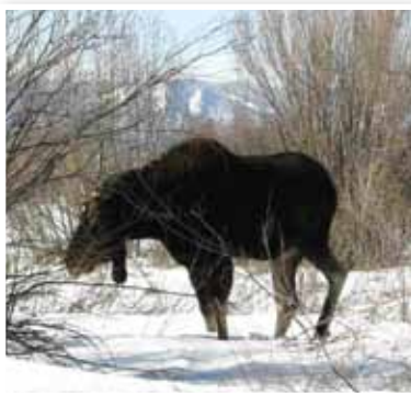
Whistler Park, Spring 2010

In 1978, the Division of Wildlife arranged for the transplant of 12 moose to Colorado's North Park region near Walden. Several other transplants followed in the coming years. Since then, moose have thrived in Colorado and have expanded their ranges into good habitats.