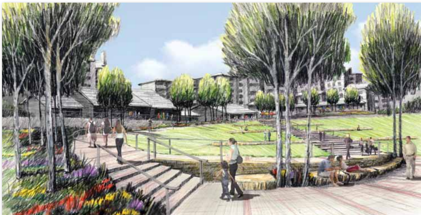
Rendering of the Promenade

* Celebrating over 25 years as Steamboat's Premiere Real Estate Brokerage *