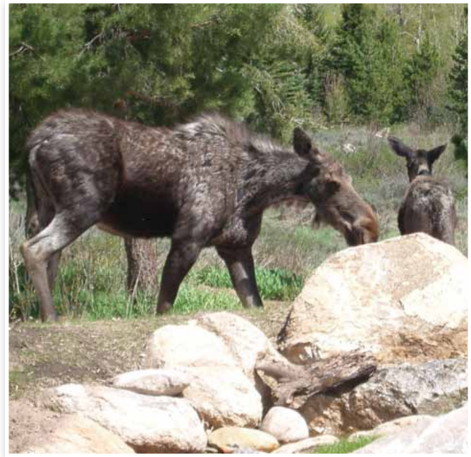
In one of our broker's backyards!

Encountering a moose is something that most people will never experience, but is something that is fairly commonplace in Steamboat! Enjoy them, respect them, use caution and common sense.