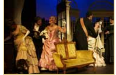
Emerald City Opera, Credit: Art Dana

Design District open houses, Plein Arts events, and experiential and educational workshops open to all ability levels. The fine art festival along Yampa Street downtown will be the heart of the event and will showcase award-winning local and regional visual artists. Enjoy performances by the Steamboat Springs Orchestra, Steamboat Dance Theatre, Emerald City Opera, African Dance and Drum Ensemble and more on the Yampa Street outdoor stage. For more information including tickets to events and workshops, please call 970-879-0880 or visit www.SteamboatSummer.com .