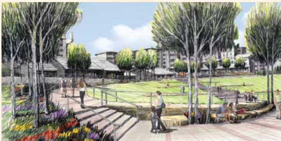
View of the Promenade from the Sheraton Hotel towards Torian Plum Plaza.

take place over the next three years. The work is scheduled to begin August 3 of this year. Initial projects totaling approximately $2.5 million will occur this summer including overall design, construction of the Burgess Creek diversion structure and plaza just east of Slopeside Grill at Torian Plum, storm sewer improvements and landscaping of the Apres Ski roundabout. The majority of the work will occur in 2010 and 2011.