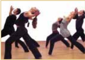
Dance Theatre

The Steamboat All Arts Festival, a fine arts festival to be held August 20-23, is the newest event in Steamboat Springs, Colorado. It was created in order to entertain and inspire locals and visitors through a world-class celebration of the arts. The four day event will highlight the amazing arts and culture in the Yampa Valley while featuring nationally-renowned artists. The Festival kicks off on Thursday, August 20, with a free concert at Howelsen Hill by the Avett Brothers, and George Winston will be the featured performer at the Strings Music Pavilion on Friday night. The weekend continues with fine art walks,