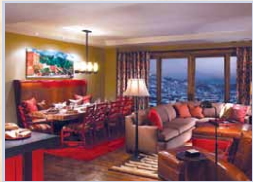
The model residence offers a preview of what's to come at One Steamboat Place.

Situated on the edge of the Steamboat Ski Resort, Edgemont's 'click-in and go' access to the ski slopes is unmatched by any other new real estate available in Steamboat. With spectacular views from every home, owners at Edgemont will enjoy spacious open floor plans ideal for entertaining, as well as community amenities that bring neighbors together outside the home. Amenities include an outdoor heated pool, hot tubs and fire pit, ski lockers, family game and media rooms, a fitness facility and underground parking. www.edgemontliving.com .